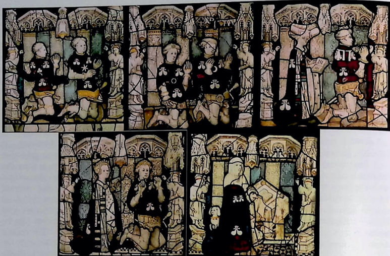
Roos family St William window

of friends and kinsfolk on a tomb would enable them to benefit from the prayers being said for the deceased. The benefit might also work in the opposite direction: placing the arms of revered saints and great heroes of the past in a church encouraged them to watch over it. Their spiritual presence in the building thus secured would facilitate their readiness to intercede in heaven for the church and for those who supported it.